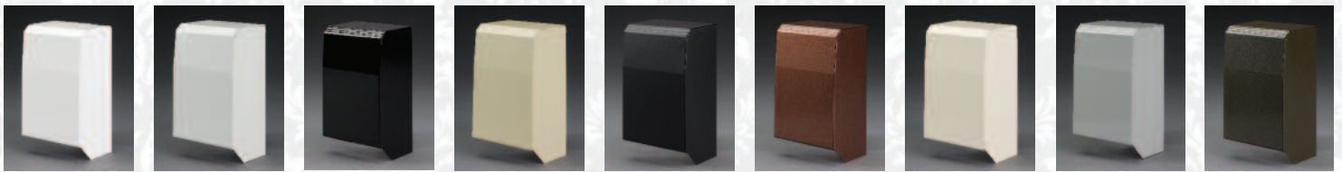
Brite White (Standard)